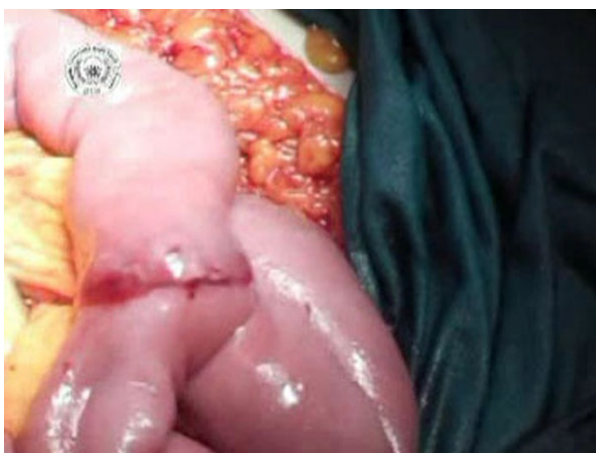
Figure 4 The BAR is snapped forming a serosa-to-serosa inverted sutureless anastomosis.

64 end-to-side Roux-and-Y jejunostomies were performed using a BAR after 57 total gastrectomy and 7 gastric resections. 59 end-to-side Roux-and-Y jejunostomy suture method anastomoses were performed after 57 total gastrectomy and 2 gastric resections for gastric cancer. The mean time spent to complete a BAR anastomosis was 11 \pm 4 min, being the time spent to perform hand sewn anastomosis 23 \pm 7 min ( p=0.030 ). In the BAR group the estimated operative blood loss was lower compared to the suture-method group ( 178 \pm 32 ml and 182 \pm 23 ml respectively), however the difference didn't reach a statistical significance ( p=0.065 ). The postoperative course was uneventful in 75% ( n=44 )