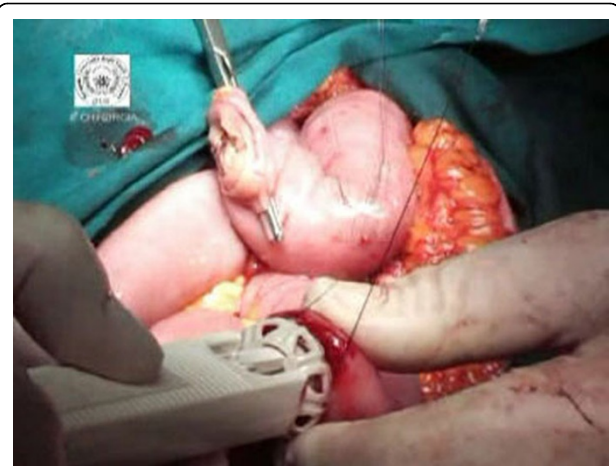
Figure 1 Introduction of 28mm BAR into the proximal jejunum.

the second pursestring is tied (Figures 2 and 3). The BAR is snapped shut by index finger and thumb pressure of two hands, forming a serosa-to-serosa inverted sutureless anastomosis (Figure 4). Before closing the ring the possible rotational error at the anastomosis is corrected. The manually sutured jejunojejunal anastomosis, following the same procedures as described for sutureless anastomosis, is achieved by continuous 3-0 polyglycolic acid multifilament in two layers with inversion technique. Patient demographics, operative procedure, type and location of the anastomosis, overall operating time, intraoperative blood loss, postoperative course and complications, if observed, were recorded for every patient. Postoperative completeness of the BAR anastomosis and fragmentation of the BAR ring were confirmed by abdominal x-ray at 7 th and 30 th day after surgery. The study was approved by the ethics committee of Second University of Naples and