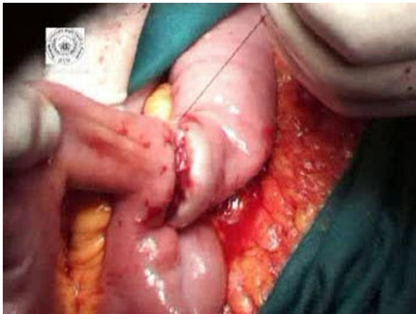
Figure 3 The second purse-string is tied.

conducted according to the ethical standards of the Helsinki declaration. Each patient gave informed written consent.