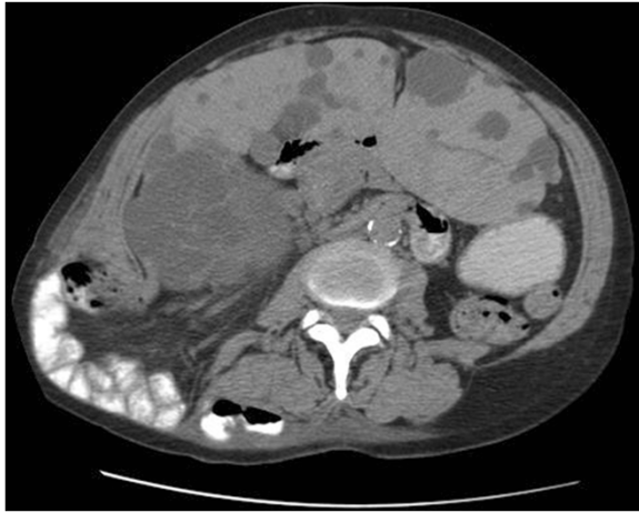
Figure 1 Axial CT scan demonstrating incisional lumbar hernia.

lump, clinically in keeping with a possible lumbar hernia. An urgent CT scan of the abdomen and pelvis confirmed the diagnosis of a lumbar hernia containing the majority of the small bowel and right colon (Figures 1 and 2). The CT scan also demonstrated an incidental finding of an enlarged polycystic liver.