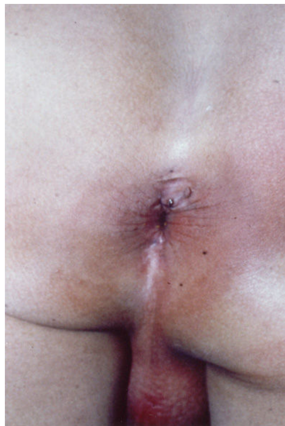
Figure 2 Thiersch's wire is shown eroding through the perianal skin.

The exact diagnosis of acute scrotum is very difficult in spite of available diagnostic means. The majority of cases require surgical exploration to rule out a testicular torsion. Careful history taking and physical examination can, as in this case, save the child from an operation.