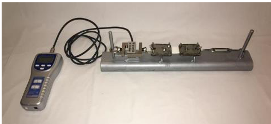
Fig. 2 System of clamps and screws used for graduated distension of the skin

With respect to the anthropometric data, the abdominal circumference tended to be greater among the