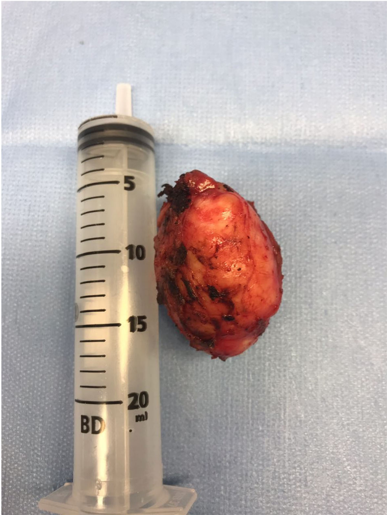
Fig. 4 The tumor