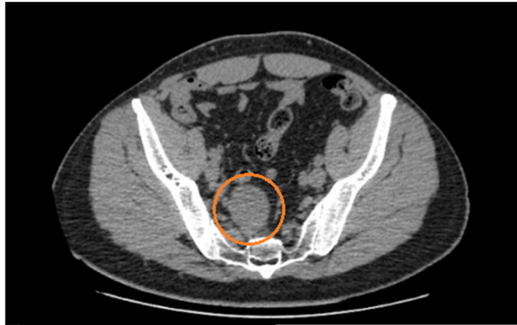
Fig. 1 CT of the transversal plane of the presacral region. Note the schwannoma (red circle), with dimensions of 4.4 × 3.9 × 3.4 cm

the right median presacral region, at the level of vertebrae S1 and S2, measuring approximately 4.4 × 3.9 × 3.4 cm. There were no other abdominal abnormalities. The decision to perform an excision surgery was based on the symptoms (associated with the topography of the tumor) and the need of diagnosis since the CT was inconclusive. There was no suspicious diagnosis related to the previous tumor.