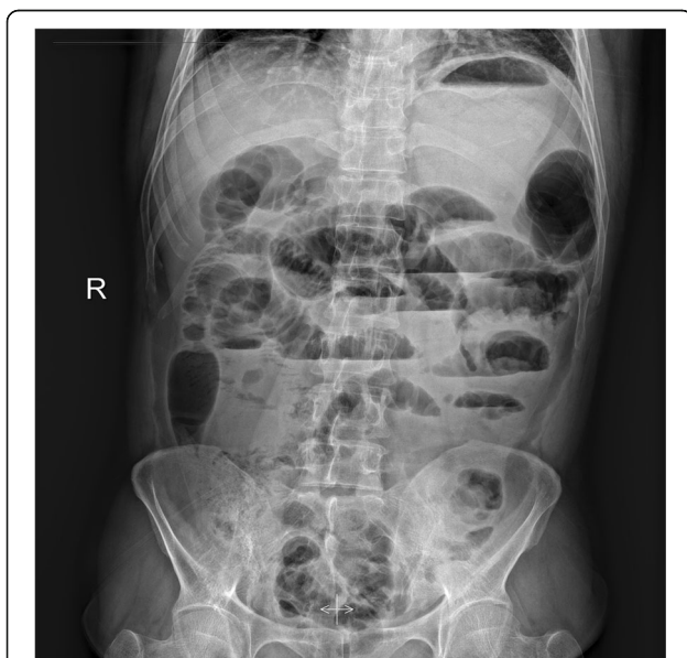
Fig. 1 Erect abdominal x-ray at admission showing hugely dilated small bowel, with multiple air-fluid levels

The clinical symptoms are nonspecific and variable ranging from asymptomatic to recurrent colicky abdominal pain, nausea, vomiting, abdominal distension, abdominal ascites, constipation, anorexia, malnutrition and weight loss. Preoperative diagnosis of cocoon abdomen is really challenge and most cases have been discovered incidentally during or after the operation. Imaging examinations might be helpful for preoperative diagnosis: 1. Erect abdominal x-ray: the main manifestation is intestinal obstruction for example, hugely dilated small intestinal or multiple air-fluid levels; however, sometimes normal phenomena are also presented and it is nonspecificity. 2. Transabdominal ultrasound: dilated bowel loops enclosed within a membrane, peritoneal thickening and ascites are observed. 3. Barium meal films: the characteristic serpentine structure of the distal and inner cocoon dilated small intestine can be displayed. 4. Abdominal CT: the sign on CT is shown as a serpentine configuration of dilated small intestinal loops in a U-shaped cluster. Contrast-enhanced CT is the imaging modality of choice for the diagnosis of an abdominal cocoon [13] and Preoperative Contrast-enhanced CT can diagnose it accurately [14, 15]. The main symptom of cocoon abdomen is encapsulated sign. Other associated findings may be ascites, loculated fluid, bowel wall thickening, peritoneal calcification and reactive lymphadenopathy [16]. In addition, the membrane tissues showed