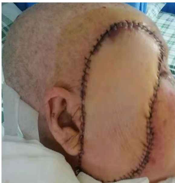
Fig. 3 Postoperative view. The patient was discharged on postoperative day 7