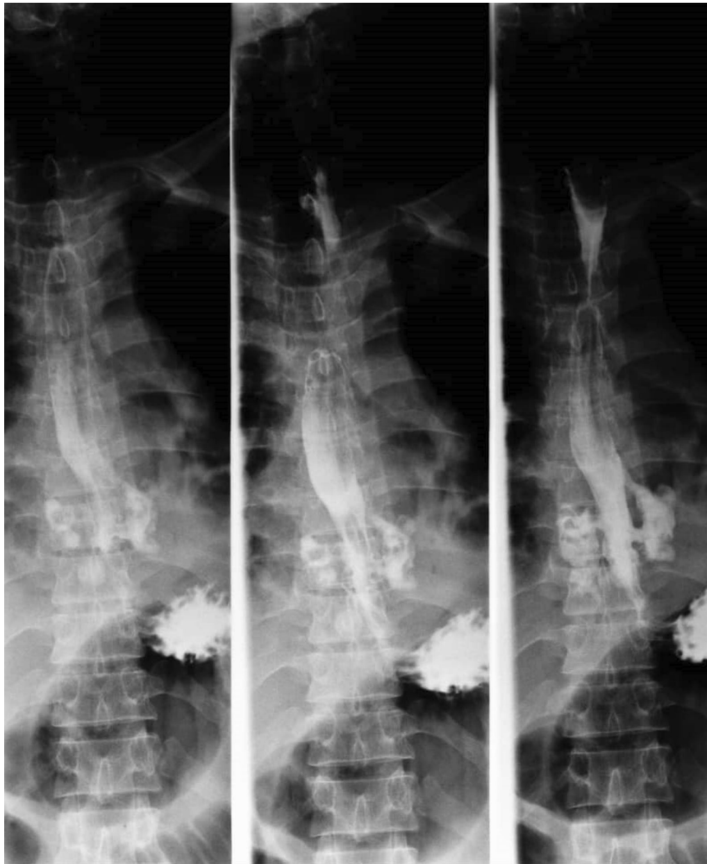
Fig. 2 Barium esophagogram demonstrating bilateral perforations in the lower third of the esophagus

resulting in the absence of clinical practice implication of these methods in our center.