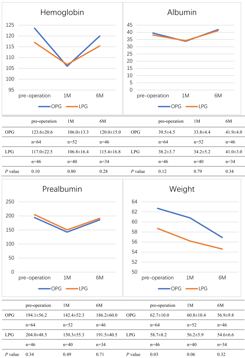
Fig. 2 Comparison of the nutrition indexes between OPG with DTR and LPG with DTR. OPG: open proximal gastrectomy; LPG: laparoscopic proximal gastrectomy; 1 M: 1 month after surgery; 6 M: 6 months after surgery